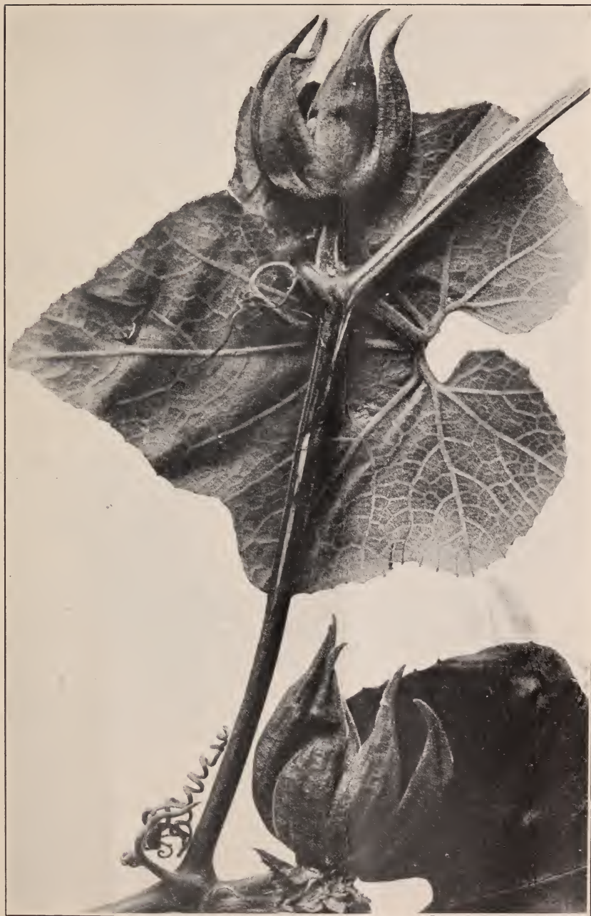
CALYCOPHYLLUM BREVIPES PITTIER.